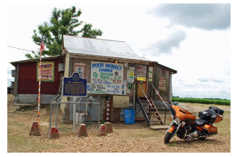
2014 Harley Ultra Limited

We did try a Harley for a couple years. No complaints here! We loved that bike too! But, it just wasn't a GL1800.