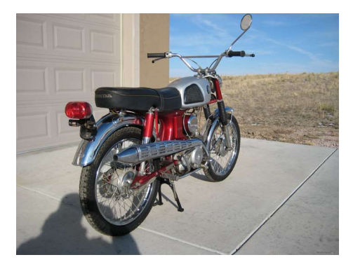
1973 Honda CB90

My next bike was a used Honda CB90. I'm sorry, I hated this bike!