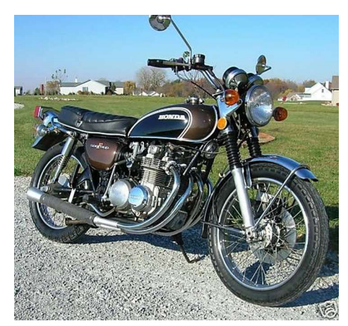
Dad's Honda CB550

This bike was identical to the Honda 750. Dad must have been color blind because this bike was purple too! It was awesome! When I would mention purple, he would tell me "No!" that bike is brown! The title even said brown! Like a lot of people, Dad never got interested in riding much. When my parents would leave the house for the evening, I would sneak it out and ride it. It was all I could do to push it out of the garage. The first time I rode it, I almost lost it in our gravel driveway! Whew!