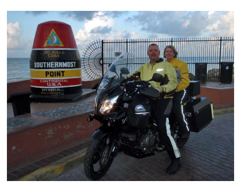
2009 Suzuki V-Strom

We owned a Suzuki V-Strom as a second bike for a few years. I rode this bike to Alaska. Another great bike for what it's designed. An 80/20 (80% street/20% off-road) adventure bike.