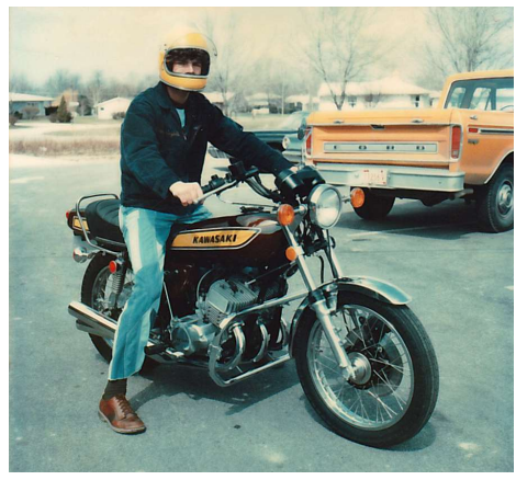
1975 Kawasaki 500

But, my junior year in High School, I wanted my own street machine. I wanted the original "crotch rocket"! The Kawasaki 500 triple!