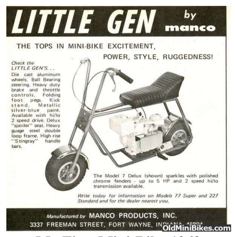
My First Mini-Bike 1969

In 1969, when I was 10 years old. I bought my first mini-bike, a 3 ½ horse, double-tubular framed basic mini-bike for $90. It was chain drive with a centrifical clutch. My Dad showed me how to pull start it with the choke one time. After that, I was pretty much on my own. I learned how to clean spark plugs when they got fouled, oil the chain, clean the air filter, etc.