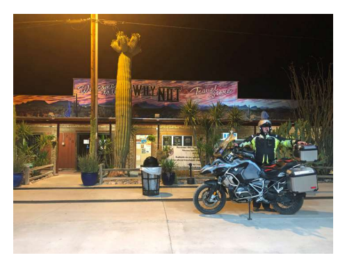
2019 BMW R1250GSA

But, if we were talking solo adventure riding I might be talking a different story altogether!